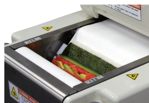
4. It starts rolling