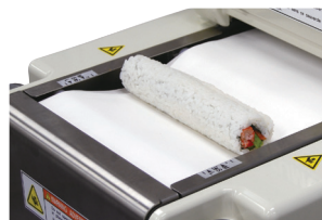
6. Forms beautiful rolls