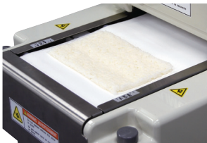
1. It spreads sushi rice onto the forming sheet