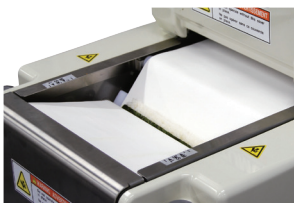
5. Automatically roll up