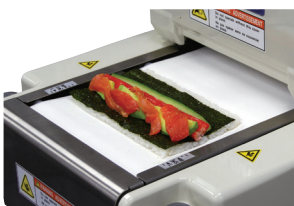
3. Place ingredients by hand