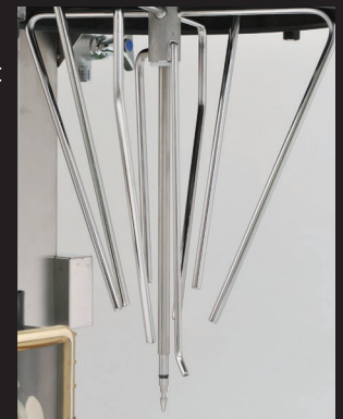
*The multi-angled Stirring Blade (Rice Washing Tank not shown)

The multi-angled design of the Stirring Blade ensures the rice is evenly stirred. The Bran – the hard outer layer of the grains of rice – is quickly and efficiently removed to contribute to efficient rice washing in a remarkably reduced amount of time.