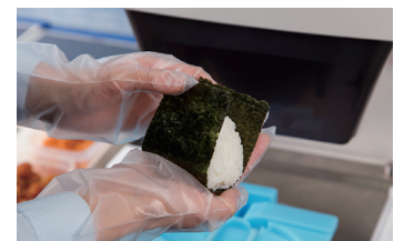
8. Finish to make

TOA dimension: 310Wx370Dx84H mm After setup dimension: 395Wx640Dx609.5H mm *Excluding optional molds Weight: Approx. 3.5kg