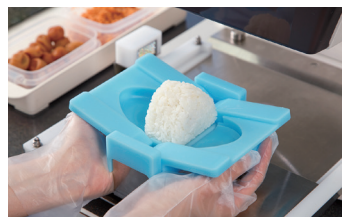
6. Shaping is done