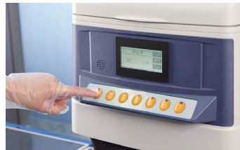
2. Press the button