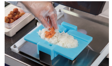
4. Put ingredient