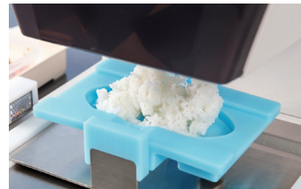
3. Supply weighed rice