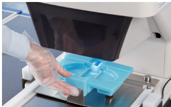
1. Set TOA Frame