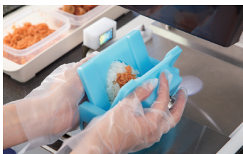
5. Close the mold softly