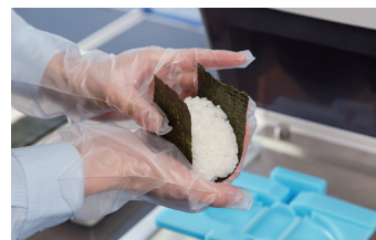
7. Put sea-weed around Rice-ball